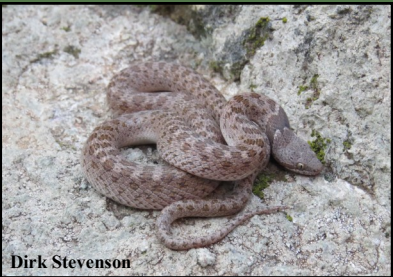
Chihuahuan Nightsnake ( Hypsiglena jani )