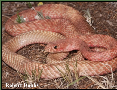
Western Coachwhip ( Masticophis flagellum testaceus )

Note: The non-venomous Bullsnake looks very similar to the venomous Prairie Rattlesnake and will mimic the rattlesnake by shaking its tail and hissing. However, the Bullsnake does not have a rattle on the end of its tail. Use this characteristic to tell the two snakes apart.