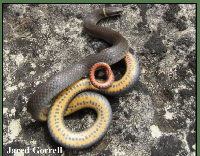
Prairie Ring-necked Snake ( Diadophis punctatus arnyi )