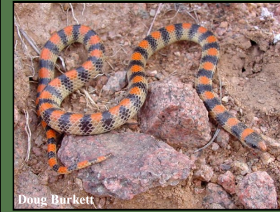
Western Groundsnake ( Sonora semiannulata )