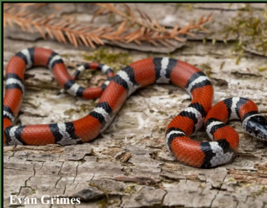
Western Milksnake ( Lampropeltis gentilis )