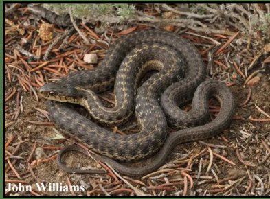
Wandering Gartersnake ( Thamnophis elegans vagrans )