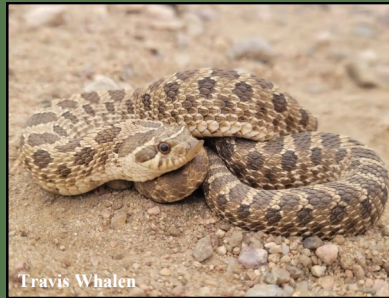
Plains Hog-nosed Snake ( Heterodon nasicus )