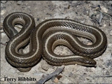
Lined Snake ( Tropidoclonion lineatum )