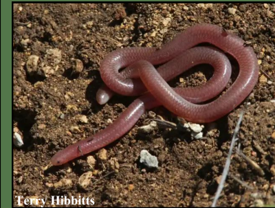
Texas Threadsnake ( Rena dulcis )