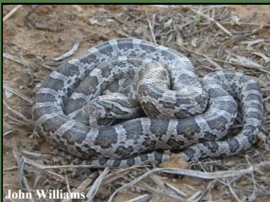
Great Plains Ratsnake ( Pantherophis emoryi )