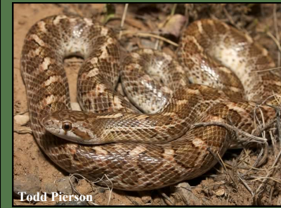
Glossy Snake ( Arizona elegans )