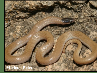
Plains Black-headed Snake ( Tantilla nigriceps )