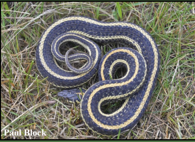
Plains Gartersnake ( Thamnophis radix )