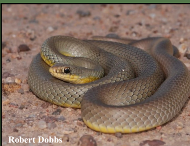
Eastern Yellow-bellied Racer ( Coluber constrictor flaviventris )