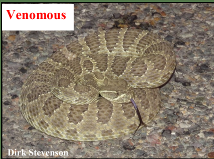
Prairie Rattlesnake ( Crotalus viridis )