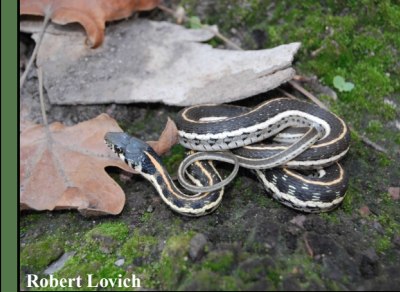
Black-necked Gartersnake ( Thamnophis cyrtopsis )