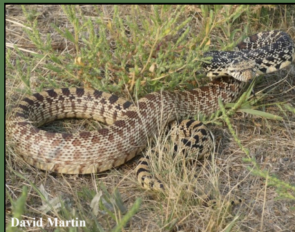
Bullsnake ( Pituophis catenifer sayi )

Note: The non-venomous Bullsnake looks very similar to the venomous Prairie Rattlesnake and will mimic the rattlesnake by shaking its tail and hissing. However, the Bullsnake does not have a rattle on the end of its tail. Use this characteristic to tell the two snakes apart.